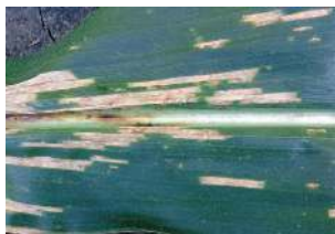
Fig. 6. Rectangular lesions of gray leaf spot (GLS) resemble BLS. GLS lesions tend to have borders that are delineated by leaf veins with sharper edges than those of BLS.

Because the disease is new to North America, research on management options for BLS has not been investigated thoroughly; however, recommendations can be based on general knowledge about the pathogen and information from South Africa.