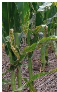
Fig. 1. Symptoms of bacterial leaf streak (BLS) disease on lower leaves.

The BLS pathogen presumably survives in previously infected host debris. Bacterial exudates found on surfaces of infected leaf tissues can serve as secondary inocula. There is no evidence that the disease is seed transmitted. The bacterium is spread by wind, splashing rain, and possibly by irrigation water. The pathogen penetrates corn leaves through natural openings such as stomata, which can result in a banded pattern of lesions occurring across leaves. Colonization of leaf tissues apparently is restricted by main veins. The pathogen does not appear to routinely invade vascular tissues; thus it does not cause a vascular wilt similar to the Goss wilt bacterium, Clavibacter michiganensis nebraskensis , or the Stewart's wilt bacterium, Pantoea stewartii . In this regard, it is much more similar to another bacterial leaf disease of corn, bacterial leaf blight (BLB) caused by Acidovorax avenae . The disease appears to increase with irrigation during hot weather (>90 °F). 1 Impacts on yield have not been documented although severity of foliar