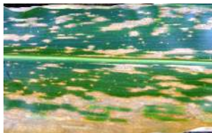
Fig. 7. Elongated, oval lesions of southern corn leaf blight (SCLB) with wavy edges that are roughly defined by leaf veins can resemble those of BLS.