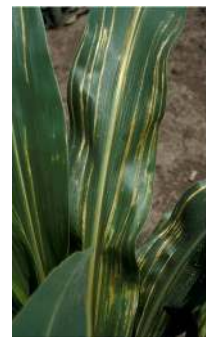
Fig. 9. Symptoms of BLB caused by Acidovorax avenae closely resemble those of Xanthomonas although BLB lesions often have more sharply delineated margins.