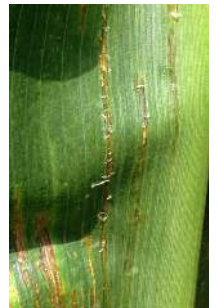
Fig. 4. Dried droplets of bacterial exudates on leaf surfaces.

Symptoms occur at any stage of corn growth but typically have been observed first on lower leaves (Fig. 1) with spread to the middle and upper portion of the crop canopy after flowering. Initial symptoms first appear as translucent, water-soaked streaks between veins (Fig. 2a, 2b) and progress to longer yellowish to necrotic streaks that can coalesce to form larger areas of symptomatic tissue (Fig. 3). Bacterial exudates on the leaf surface may appear as small, dried, yellow-colored droplets (Fig. 4).