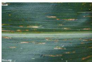
Figs. 8a and 8b. Symptoms of northern corn leaf spot race 3 caused by Bipolaris zeicola race 3 (Syn: Helminthosporium carbonum race 3): a series of consecutive small oval lesions limited by leaf veins having a “string of pearls” type appearance resemble symptoms of BLS.