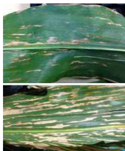
Figs. 3a and 3b. Lesions of BLS coalesce as leaf tissue dies creating large areas of necrosis.

symptoms have approached 40% leaf area infected on susceptible products. 2 Because it appears to be entirely a foliar pathogen and does not infect plants systemically or cause a vascular wilt, it is highly unlikely that BLS will have an impact on yield similar to that of Goss's wilt.