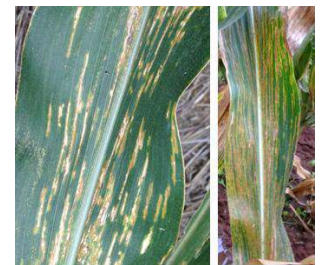
Fig. 5a and 5b. Typical symptoms of the bacterial leaf streak (left). Symptoms on a susceptible corn product (right).

Symptoms of BLS (Figs. 5a and 5b) are similar to those of at least four other foliar diseases of corn: GLS - gray leaf spot (Fig. 6), SCLB - southern corn leaf blight (Fig. 7), NCLS3 - northern corn leaf spot race 3 (Figs. 8a and 8b) and BLB - bacterial leaf blight, caused by Acidovorax avenae (Fig. 9). Of these four diseases, GLS is most likely to occur in areas where BLS has been found recently. SCLB and BLB are more likely to occur in warmer areas of the southern United States. NCLS race 3 is more prevalent in cooler, northern regions.