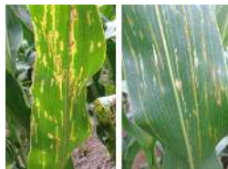
Fig. 2a and 2b. BLS symptoms: translucent, water-soaked streaks between veins (left). Elongated streaks of BLS lesions restricted by main veins (right).