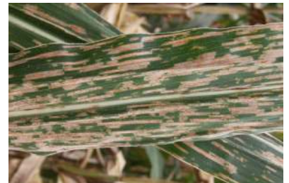
Figure 10. Gray leaf spot on a corn leaf.

Gray to tan, rectangular lesions on leaves, leaf sheaths, or husks. Spots are opaque and long (up to 2 inches). Lower leaves are affected first, usually not until after silking. Lesions may have a gray, downy appearance on the underside of leaves where the fungus sporulates. The organism thrives in extended periods of warm, overcast days and high humidity. Gray leaf spot has become more prevalent with increased use of reduced tillage and continuous corn.