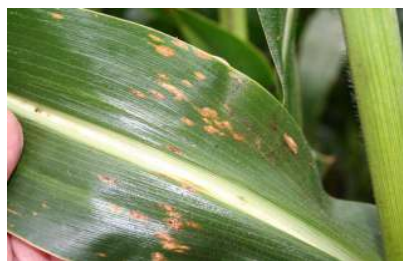
Figure 8. Common rust on a corn leaf.

As infections mature, pustules become surrounded by necrotic tissues (Figure 8). In contrast, pustules of southern corn rust are orange-colored and occur primarily on the upper leaf surface. Rust pustules rupture the leaf surface (epidermis) and powdery rust spores can be rubbed off. Pustules become dark brown to black late in the growing season. The fungus is favored by moderate to cool temperatures and high humidity. The fungus does not overwinter in the Corn Belt, but arrives each season from crops grown in Mexico, the Caribbean, and the Southern United States.