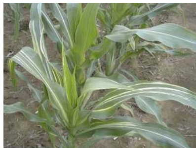
Figure 3. Stewart's wilt on a corn leaf.

Symptoms of Stewart's wilt or Stewart's disease are long, green-gray, water-soaked lesions that roughly follow leaf veins with wavy margins. Systematically-infected plants may be stunted and showing signs of wilt, which can lead to plant death during the seedling