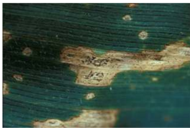
Figure 1. Anthracnose on a corn leaf.

Oval to irregular-shaped water-soaked lesions on the youngest leaves turn tan to brown often with yellow to reddish brown borders. Setae (small, black hair-like structures) may sometimes be visible in the middle of lesions. Heavily infected leaves can wither and die. This disease thrives in warm, humid weather. The same fungal pathogen is responsible for both anthracnose leaf blight and stalk rot; however, the presence of leaf blight does not indicate that stalk rot will be a problem later in the season. The stalk rot phase is often more damaging than the leaf blight phase.