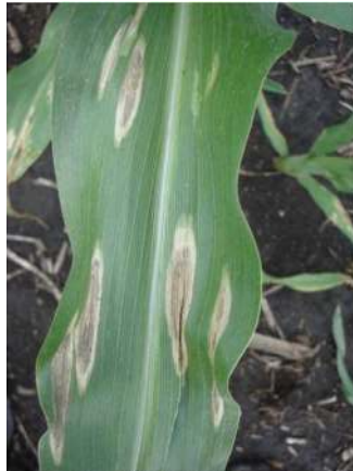
Figure 6. Northern corn leaf blight on a corn leaf.

Long (up to 6 inches), elliptical to cigar-shaped, gray-green lesions that eventually become tan-brown are symptomatic of infection by this fungus. Infection begins first on lower leaves and moves up the plant. Lesions may form in bands across leaves as a result of an infection in the whorl. The disease is favored by high humidity and moderate temperatures. Under humid conditions, lesions may have a dark, fuzzy appearance because the fungus is sporulating on dead tissues (Figure 6).