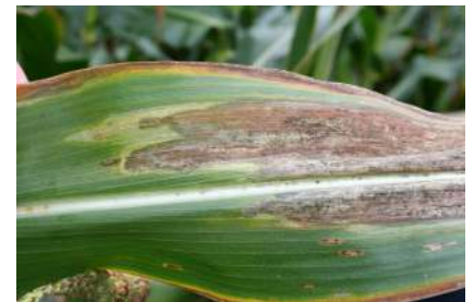
Figure 4. Goss's Wilt on a corn leaf.

Seedlings can be systemically infected, which may cause wilting and death. Vascular bundles may be discolored. More common later-season infections of leaves produce dull gray-green to necrotic lesions often with irregular margins. Small, water-soaked "freckles" appear within developing lesions and at the margins of lesions. Bacterial droplets may ooze from infected tissues early in the morning leaving a shellac-like shiny appearance when dried on leaf surfaces. Plant injury, such as hail or wind damage, can increase infection.