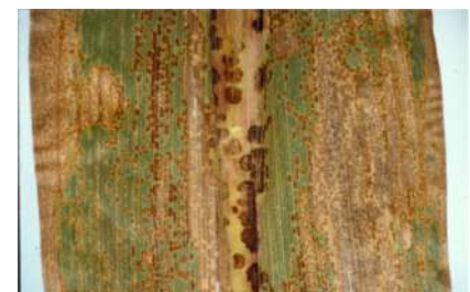
Figure 5. Physoderma brown spot on a corn leaf.

Small yellow spots appear first at the base of the leaf. These spots become brown and combine to form chocolate-brown to reddish irregular blotches, sometimes as bands of infection across leaf blades. Leaf sheaths, husks, tassels, stalks, and leaves may exhibit symptoms late in the season. Infected stalks may break at a node. This fungus is favored by warm, wet weather.