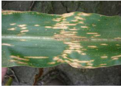
Figure 7. Southern corn leaf blight on a corn leaf.

Small, elongated (up to 1-inch long), parallel-sided lesions that are tan with brownish borders are typical, although symptoms vary considerably on different corn products, often requiring microscopic examination of the fungal structures to confirm diagnoses. This blight primarily attacks leaves, and will overwinter in corn residue. This disease favors high humidity and warm temperatures.