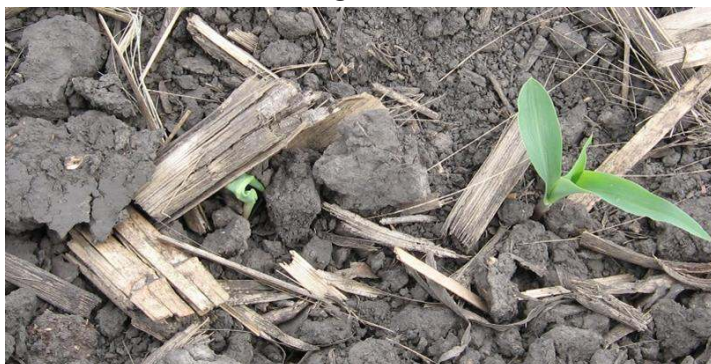
Figure 3. Premature rupture of the coleoptile and 'leafing out' may look like a 'shepherd's crook' and can be caused by crusted soil and chilling injury.

Soil Crusting. As wet soils dry, a crust layer can form on the soil surface and could delay or prevent seedling emergence. Crusting may be more common in fields with fine textured soils, low organic matter, and little surface residue, especially where excessive tillage has taken place. A rotary hoe can break the crust to help seedling emergence. Timing is essential and breaking the crust as soon as possible is most beneficial. Cooler soils will allow seedlings to survive longer when trying to break through the crust as long as seeds are not infected with disease.