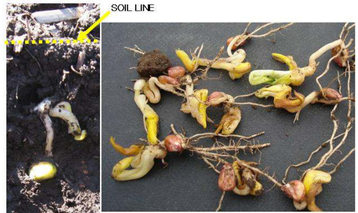
Figure 2. Under conditions such as prolonged exposure to cool soil temperatures, the mesocotyl can grow abnormally resulting in premature rupture of the coleoptile and leafing out below the soil surface.

coleoptile, it is difficult for leaves to penetrate the soil surface. There are often several factors that can contribute to problems with leafing out, including: planting depth, soil compaction, chilling injury, soil crusting, and saturated soil conditions.