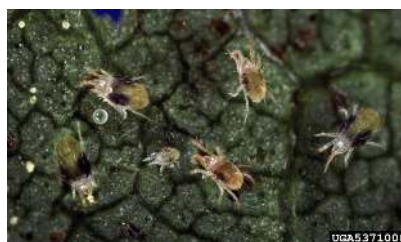
Figure 2. Two-spotted spider mite adults.

Both species overwinter as females. When the weather warms, females lay pearly-white, spherical eggs. Mites have three immature stages followed by an adult stage. Generation times depend on temperature and can range from 4 to 20 days. 1,2 Under ideal conditions, spider mite populations can increase 70-fold in one generation. 2