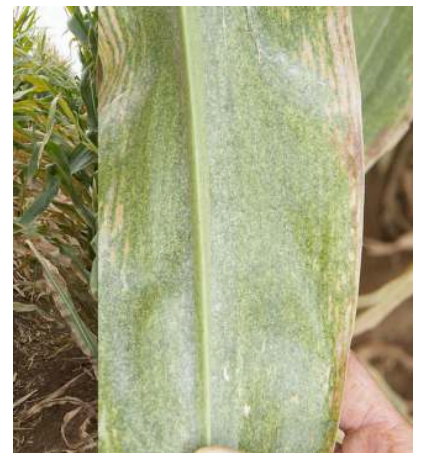
Figure 3. Spider mite feeding damage (stippling).

Spider mites feed on the undersides of leaves and damage corn by removing plant sap, resulting in leaf discoloration characterized by yellow or whitish spotting (stippling) across the surface of the corn leaf (Figure 3). This damage reduces the photosynthetic abilities of the leaf and increases water loss. Spider mite feeding can eventually kill the corn leaf, leaving it with a scorched or burned appearance.