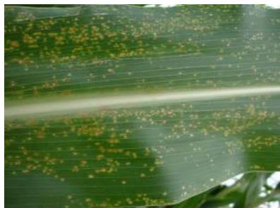
Figure 2. Eyespot on a corn leaf.

Small (less than 1/4 inch), circular, translucent lesions surrounded by yellow to purple margins that visually produce a halo effect. Lesions occur on leaves early or late in the season, leaf sheaths, and husks. The disease is favored by cool, moist weather.